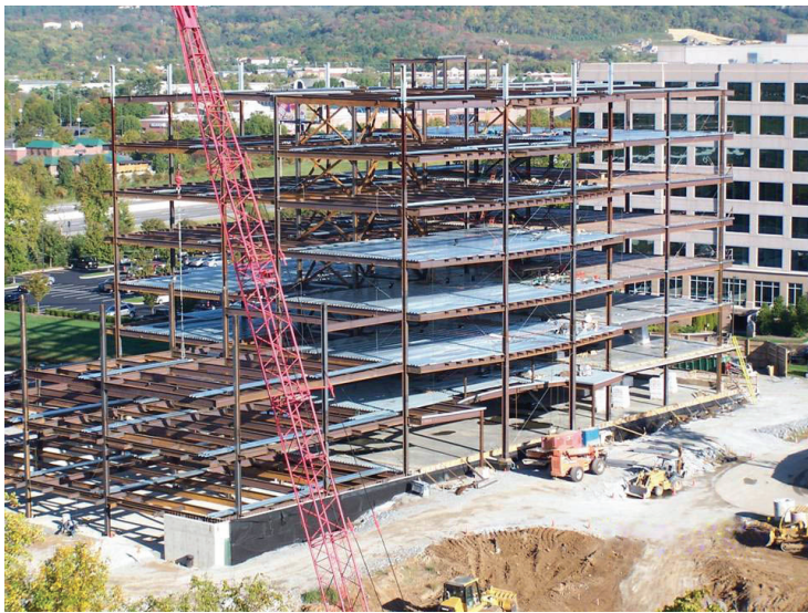
5000 Meridian, slated to complete September 2012

Completion for both is set for September 2012, with the tenant buildout process starting as soon as April 1, 2012.