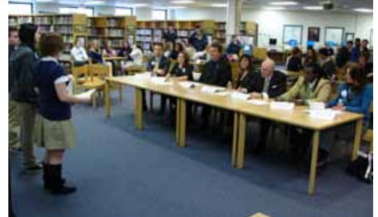
Seniors present their business idea to the panel of judges at Centennial High School during the final round of the Business Idea Competition.